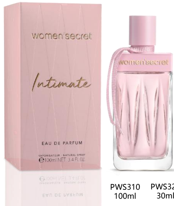
PWS310 100ml PWS322 30ml

“The modern femininity and sensuality of a tonka bean, revealed by an elegant duo of white flowers, and enveloped in a soft skin musk.”