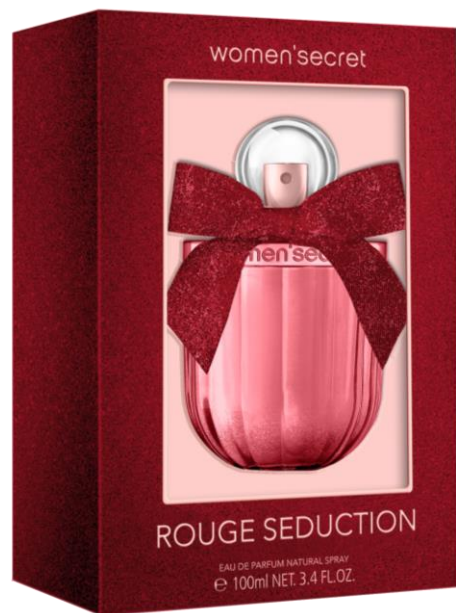
EDP 100ML PWS390